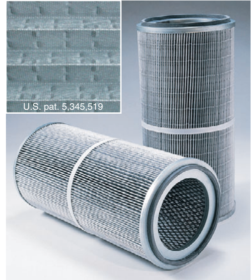
MikroBoss media allows a significant increase in effective filter area. Antistatic spunbond polyester media shown.